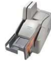
Sometimes RDC just isn't enough!

For almost two decades, ImageScan Inc. has delivered complex transaction processing solutions, in a quick-time-to-market fashion, serving industries across the business spectrum—they’ve just added another one.